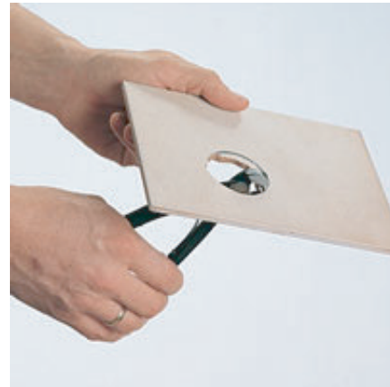
4. If you need other shapes or larger holes, you can work out any other diameter with the help of tile punch pliers.