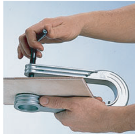
2. Insert the wall or floor tile so that the glazed surface of the tile is visible through the opening. Then tighten the spindle at the backside of the tile.