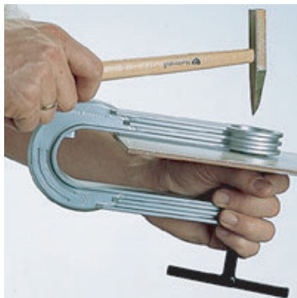
3. Start to knock out (with the point of the tile hammer) the hole in the middle and continue outwards. That way you can easily enlarge the hole diameter.